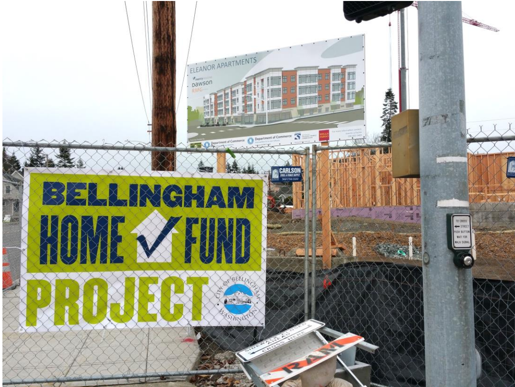
On Ellis St, new dense and affordable apartments are being built for low-income seniors. Good for the climate, good for people.